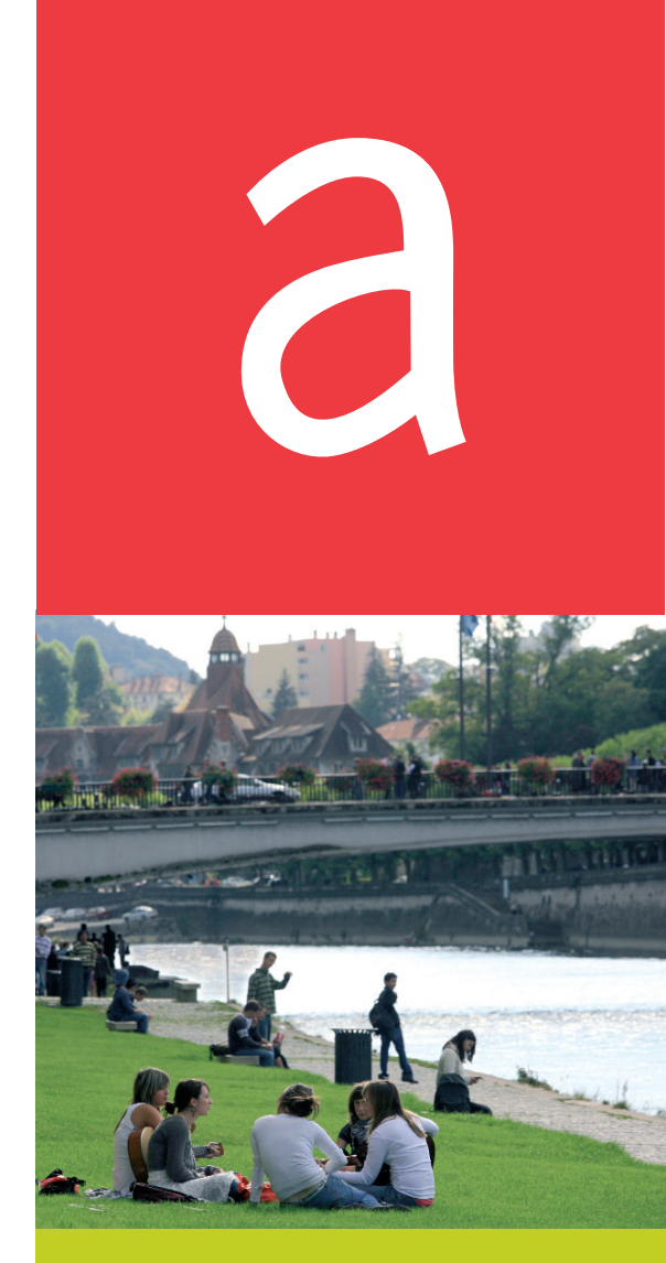
The CLA, just minutes from the town centre of Besançon and its services